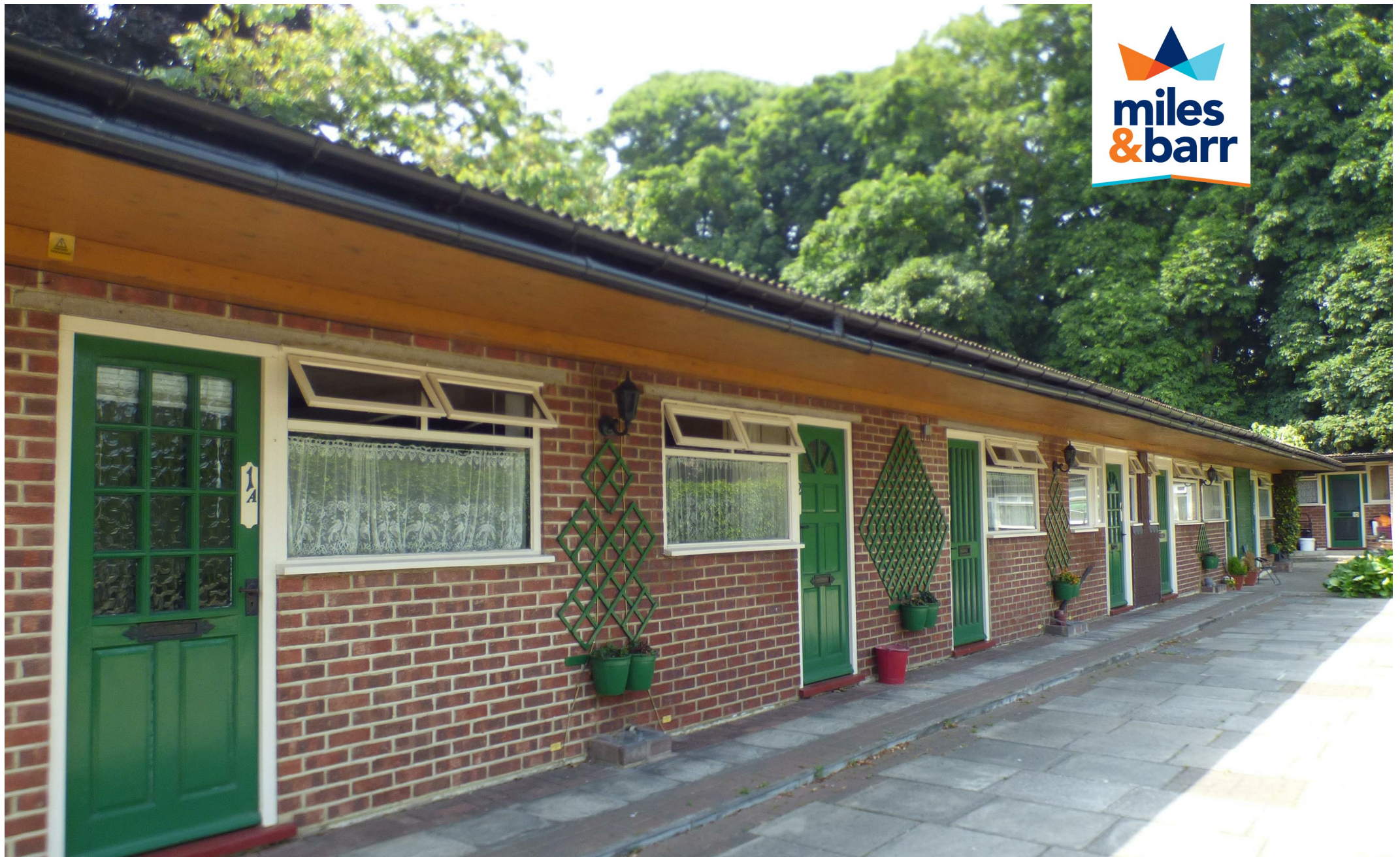
CHALET 1A 23 SOUTH EASTERN ROAD RAMSGATE